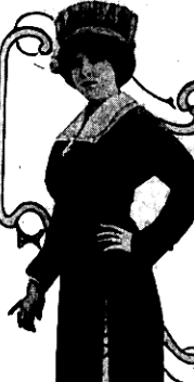
Street dress of red wool voile and cream satin with collar of Bulgarian embroidery.

narrow turndown collar of the rose colored silk finished with a narrow frill of rose colored chiffon.