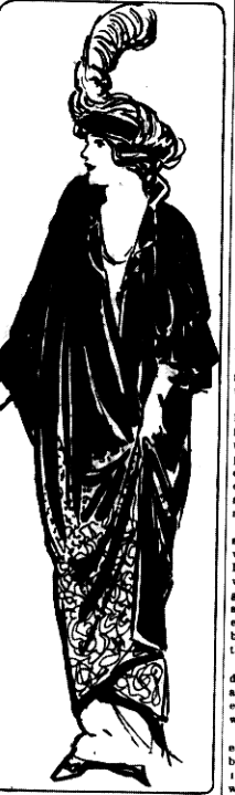
Embroidered Black Crepe.

Another cloak is of brocaded crepe de chine. At the neck there is a high turndown frill of mousseline de sole.