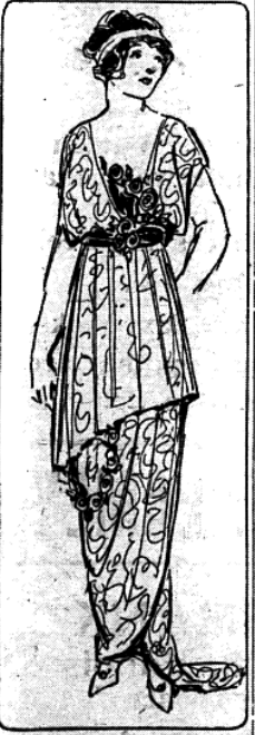
Chantilly Lace and Chiffon.

The shops are all displaying fashions they calculated to arouse the enthusiasm even of the most indifferent observer, but one house on lower Broadway had on view last week a collection of imported frocks which struck the high note of the season with regard to extravagance. Elsewhere were found models as beautiful, but nowhere else were so many superb creations shown in one group. Every famous French dressmaker was represented by the best of his or her productions, and looking over the scores of elaborate models and reading the price labels, one could not help exclaiming over the extravagance which can justify a shrewd buyer in catering after this fashion to American women. The only conclusion is that American purses must be full and American husbands and fathers must be very indulgent to permit such a season of unusual extravagance. It is also to be