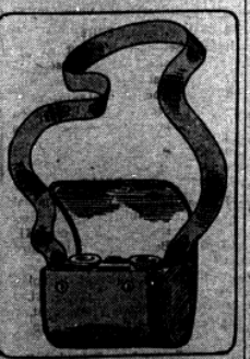
Case Ready for Use.

In our sketch may be seen a case for opera glasses, that can be made without much trouble, and in which the glasses may be comfortably carried. Any strong material may be