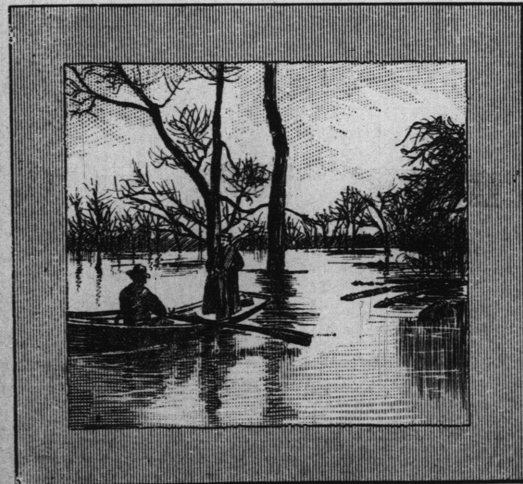
A NEWSPAPER CORRESPONDENT NEAR GREENVILLE.