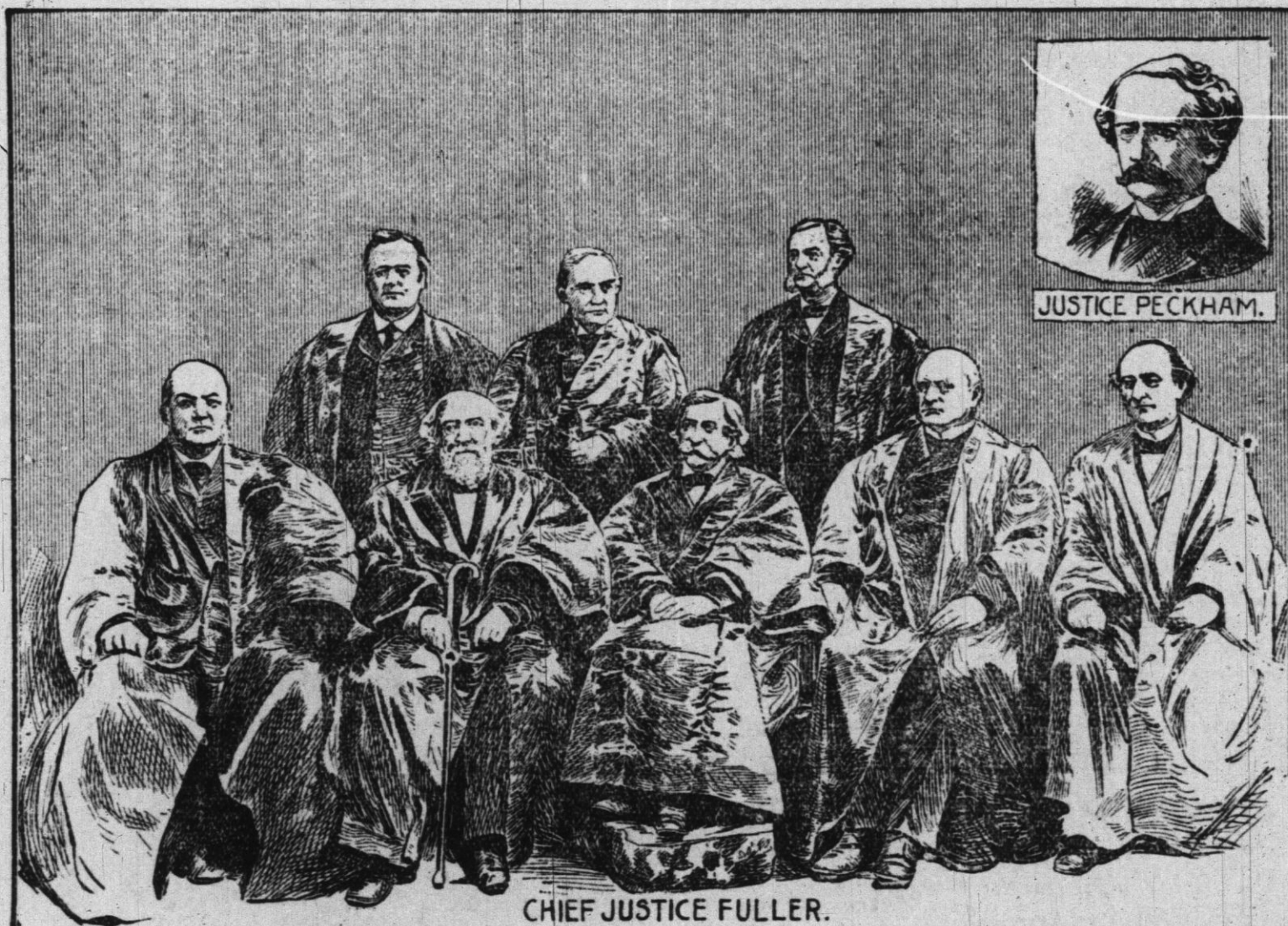
CHIEF JUSTICE FULLER. JUSTICE WHITE. JUSTICE BROWN. JUSTICE SHIRAS. JUSTICE BREWER. JUSTICE GRAY. JUSTICE FIELD. JUSTICE HARLAN. JUSTICE PECKHAM.

Above is a group picture of the present Supreme Court of the United States, the most powerful deliberative body in the world. We have the upper and lower houses of congress, and the executive to make laws; but no law ever really becomes a law until passed