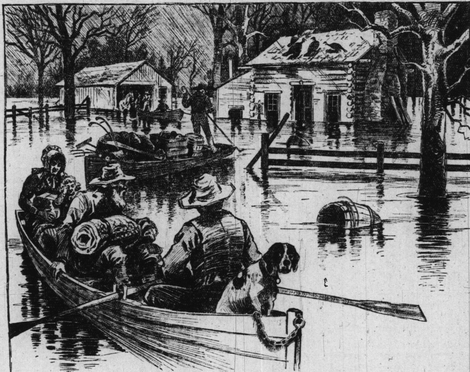
LEAVING OLD HOME TO TAKE REFUGE IN THE HILLS.

New Town, Miss., a very thickly built district, peopled almost entirely by negroes, is under water, the depth ranging from a few inches to five feet. The Belle Air, which contains many pretty homes and was beautiful with green lawns and blooming shrubs, is a Venice, and the only means the people have of leaving or returning to their homes is by boats, which are numerous and various. The water is not as high as in 1890, but will soon reach and pass that mark. Greenville itself is a city of refugees of from 15,000 to 20,000 souls. Relief boats from the interior are bringing in nearly every hour loads of destitute flood sufferers suddenly caught by the waters and driven from their homes. Hundreds and thousands of head of stock are being driven in from every direction. The back water from four crevices is pouring in fearful floods every hour, and the situation is growing rapidly worse. At Helena, Miss., the river is still rising; at St. Louis, Miss., it is rising, and the Arkansas is threatening to rise in a few days. Business men are blue, but try to keep cheerful. The worst has not yet reached the Yazoo-Mississippi Delta, and the half of its tale of woe has not been told. As soon as the different towns and cities already submerged are reached by boat parties from Greenville and as soon as the remote districts and plantations can be heard from, there will be