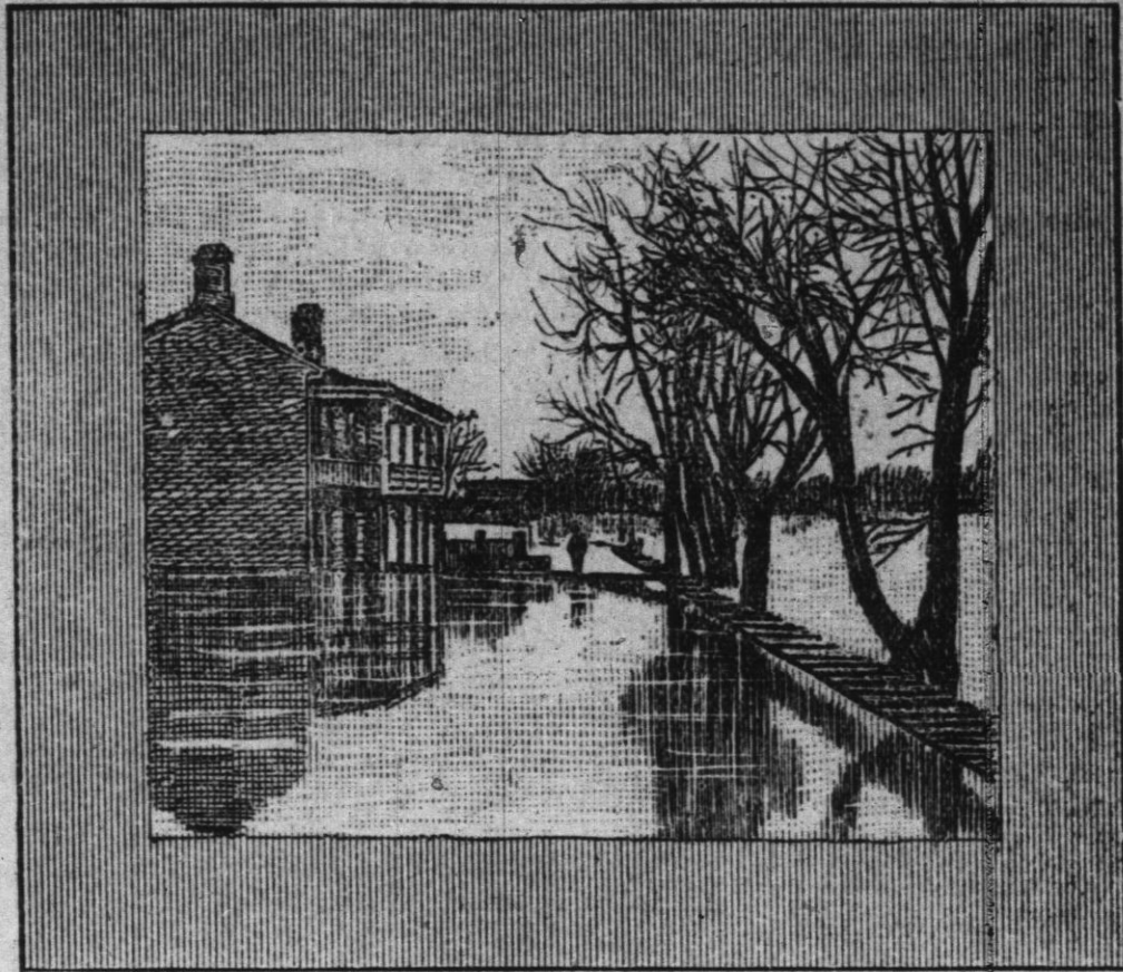
A STREET SCENE AT ANOKA, MINNESOTA.

Advices received tell of a break in the levee two miles south of Helena, Ark. This is the levee for which the people of Southeastern Arkansas have made such a desperate fight. The wa-