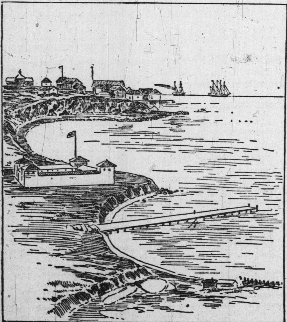
TRADING STATION ON THE YUKON.