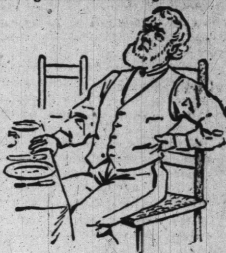
On Getting Up from the Table.

"My disease gradually became worse until I thought that death would be welcome release from my sufferings. Besides my regular physician I also consulted another, but he gave me no encouragement.