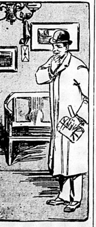
THEE WOULD LEAVE A LETTER HANGING FROM THE GAS FET.

A young married woman I know had a rather difficult disposition, but also—thank heaven!—a sense of justice and of humor. She was perfectly willing to let her husband see as many of the cards in her hand as it was necessary in order that he might put up a good game. After awhile she lived in hopes that he might be clever enough