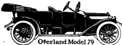
Overland Model 79