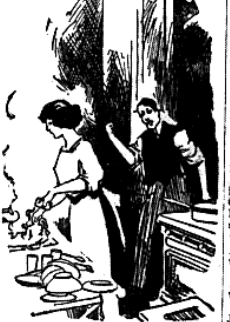
"You Fixed Up a Bench."

"Yes, and you expected me to come from the office and hang around when Daniels moved, to see that he didn't