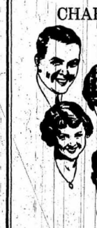
CHART YOUR FAMILY'S FUTURE NOW