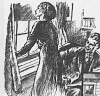
Mrs. H. doesn't like the odor from the furnace and Mr. H. doesn't like to freeze. The H's wouldn't risk these arguments if they had odorless gas heat.

good or better condition than it was the day we removed it. And anytime during the first year means during the first, second, twelfth or any other month in the year.