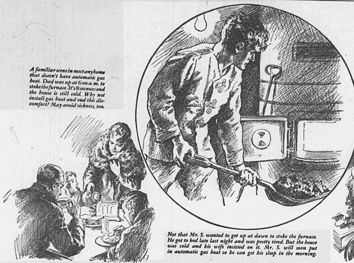
A familiar scene in most any home that doesn't have automatic gas heat. Dad was up at 6:00 a.m. to stoke the furnace. It's 8:00 a.m. and the house is still cold. Why not install gas heat and end this discomfort? May avoid sickness, too.