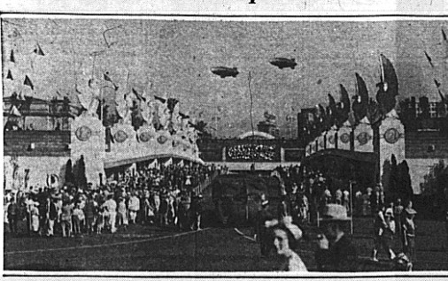
Every day is a busy day at the Great Lakes Exposition in Cleveland and this picture shows the crowds pouring across the Court of Presidents into the compact grounds of the Exposition. The grounds cover 150 acres lying along the cool shores of Lake Erie. Overhead are two of the bridges which take passengers for trips over the grounds and the city.