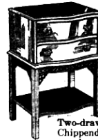
Two-drawer Chinese Chippendale Commode with Book Shelf.

A table for every purpose. Every piece smartly and authentically designed. Exceptionally well constructed and superbly finished. Many other styles that are not shown here.