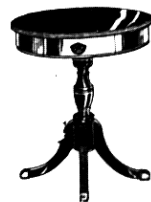
Duncan Phyfe Drum Table with Two Drawers. Walnut or Mahogany.