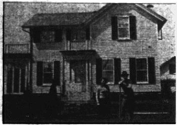
The picture above shows the residence of R. W. Muir, on Liberty street. Using the shell of the old house, it was completely remodeled and modernized and now stands as one of the show places in the village. The basement was lowered and many partitions cut and changed to re-arrange the outlay of rooms on the other floors. A recreation room in the basement with a built-in piano is one of the features of the home. Miss Marjorie Muir and Robert LaPointe are pictured above as they inspected the landscaping around the building.

Always of interest is the remodeling of homes and the construction of new ones to a particular location. Renovating old homes in the village during 1936 has been undertaken in many instances with the results achieved highly gratifying. Several of the homes are now under process of change. Ray M. Jura and Earl Schwemm are remodeling homes on North avenue and Summit street respectively.