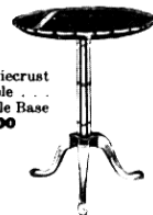
Graceful Piecrust Lamp Table . . . Chippendale Base