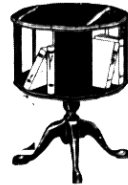
Revolving Combination Book Stand and Lamp Table.